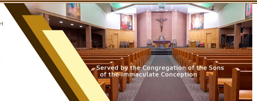
Served by the Congregation of the Sons of the Immaculate Conception

1714-14 Avenue N.E. Calgary, Alberta T2E 1G3 (403) 276-1689 office@mmredeemer.ca